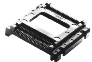
Drawing of 40-lead carrier (others available upon request)